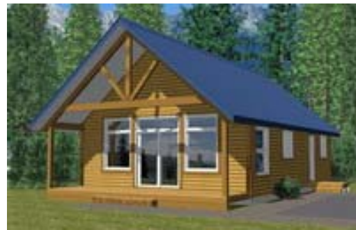
Winton Global Homes' Mt. Baker